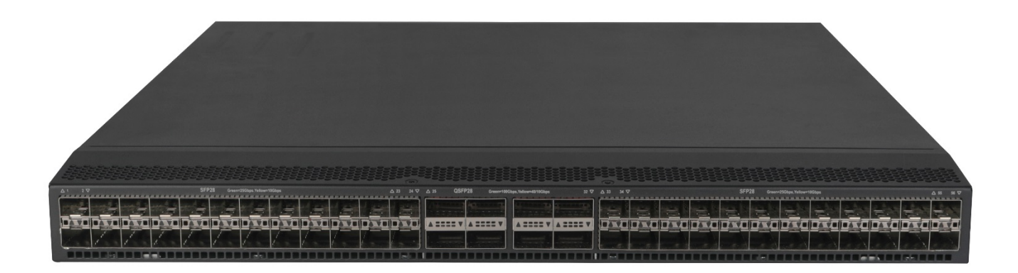
HPE FlexFabric 5945 48SFP28 8QSFP28 Switch (JQ074A)